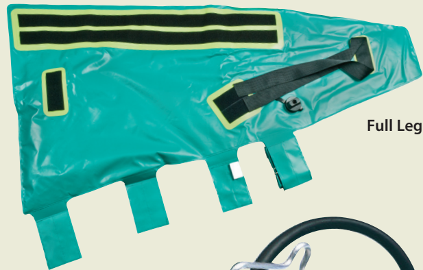
Full Leg Splint